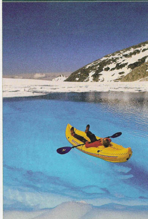
HAINES, YOUR WAY: As many visitors arrive by boat as by car. Left: Escaping the big city.